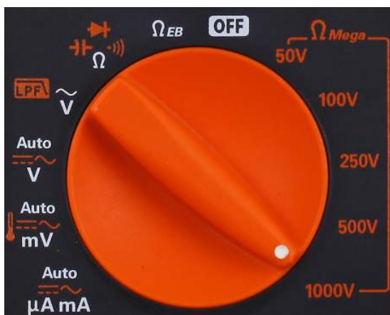
Figure 6. Insulation resistance tester with full featured DMM