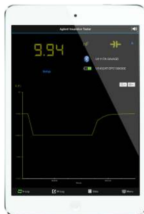
Figure 3. Data logging interface on Agilent Insulation Tester Application