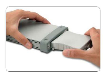
Figure 1. U2922A with U2751A used as a standalone device

The U2922A terminal block is an optional accessory used with the U2751A. The U2922A, weighing approximately 100g with screw-type terminals offers a convenient and simple way of making connection to the switch matrix for prototyping applications or for an actual system deployment. It allows the user to configure a wide variety of routing options and matrix topologies.